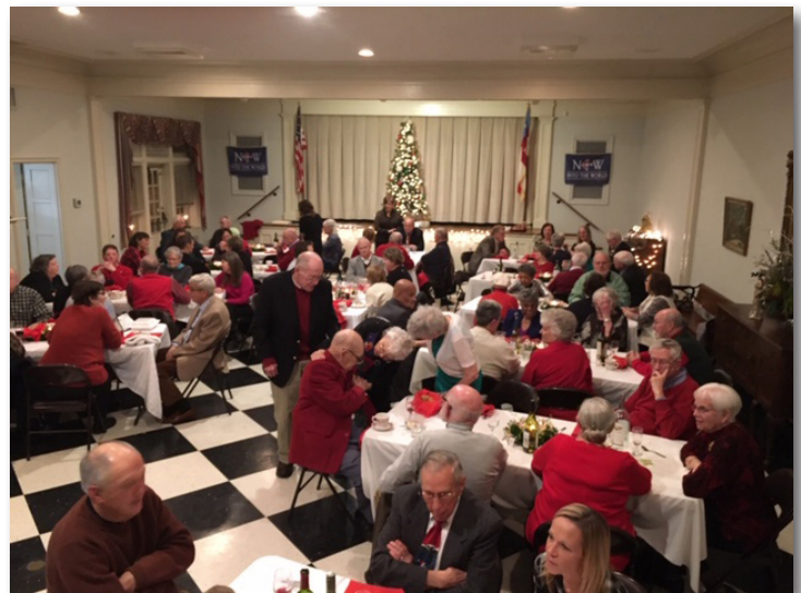
The annual Emmanuel Christmas Dinner