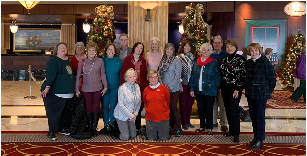
Emmanuel members and friends visited the White House and the Gaylord National Resort