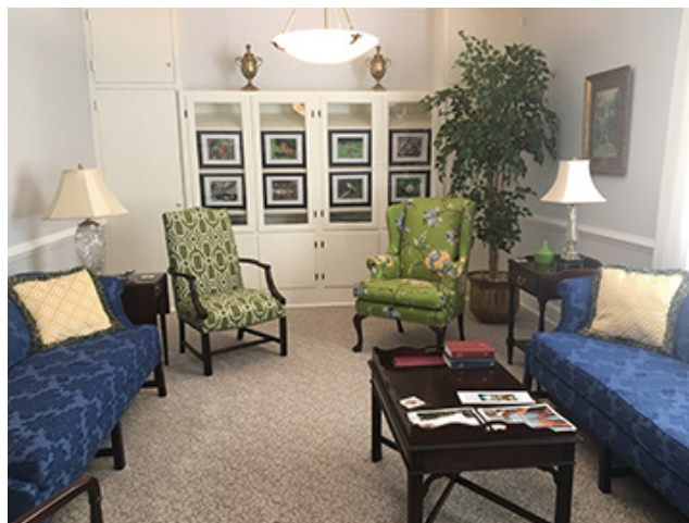
The renovated Lawrence Room was rededicated on Sunday, Oct. 28, 2018.

Christmas Dinner: Mark your calendar! Our annual Christmas dinner will be held on Friday, Dec. 7 th , in the Parish Hall. The fun starts at 6:00 p.m., with dinner catered by the Savory Grain at 6:30 p.m. More info to follow soon!