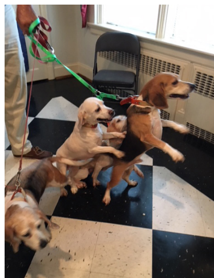
The Blessing of the Animals - Oct. 7, 2018